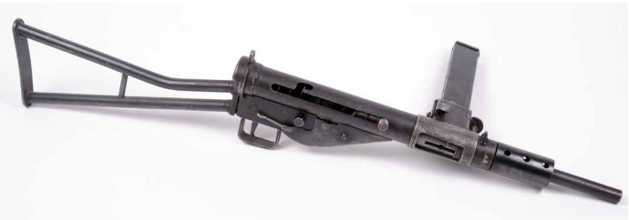
Middle: Prime Minister Ben-Gurion pins badges on graduates of a 1952 IDF officer training course. Though Marcus didn't live to see either Israel's birth or the fruition of his own efforts to modernize its military, his legacy lives on in the present-day Israel Defense Forces. Above: By the outbreak of the 1948 Arab-Israeli War manufacturers in Tel Aviv and outlying Jewish settlements were making bootleg copies of the Sten, a British submachine gun that saw widespread use in Jewish paramilitaries. Modern-day Israel is a global arms exporter, recording $12.5 billion in exports in 2022 alone.

On the night of May 29–30 IDF vehicles sent into the hills confirmed the bypass road could support motor vehicles, and IDF engineers fired up bulldozers to forge what was christened the “Burma Road,” after the famous supply road built to link Burma and China during World War II. Late to realize the IDF was building a bypass, the Jordanians attempted to prevent its completion, but to no avail. On June 19 a convoy of 140 trucks carrying food, sugar and other supplies, as well as weapons and ammunition, successfully drove the length of the Burma Road into Jerusalem.