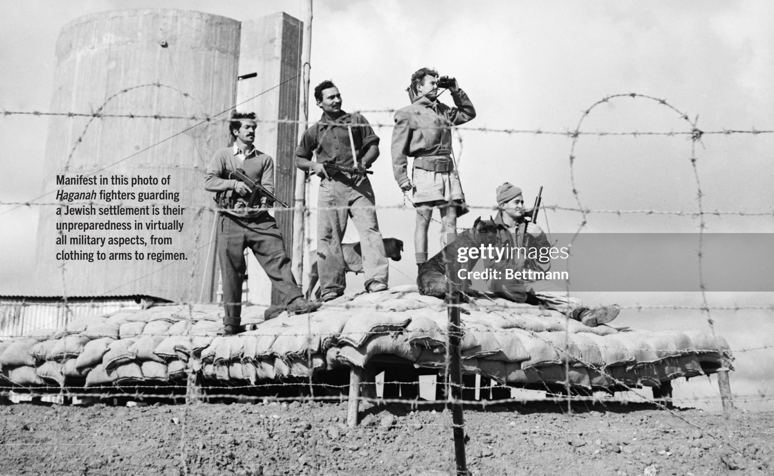
Manifest in this photo of Haganah fighters guarding a Jewish settlement is their unpreparedness in virtually all military aspects, from clothing to arms to regimen.