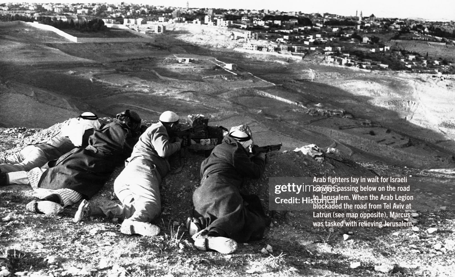
Arab fighters lay in wait for Israeli convoys passing below on the road to Jerusalem. When the Arab Legion blockaded the road from Tel Aviv at Latrun (see map opposite), Marcus was tasked with relieving Jerusalem.