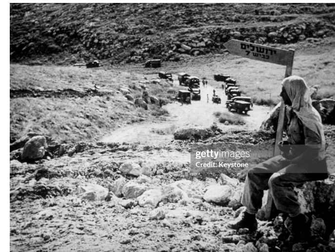
Top: After military efforts to break open the bottleneck at Latrun failed, Marcus spearheaded the creation of a bypass dubbed the "Burma Road" (a reference to the vital World War II supply route into Japanese-occupied China). Middle: Facing an ever-present threat from snipers, its road crews used heavy bulldozers and armored transport trucks to get the job done. Above: By June 19 the bypass to Jerusalem was open to Israeli convoys.