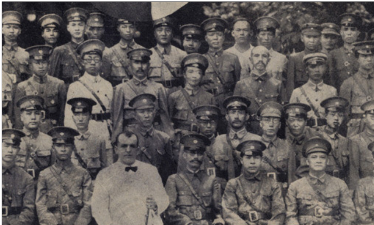
This picture of the “upper echelon” showing Two-Gun Cohen, in the white suit, seated with President Chiang Kai-Shek on his right, verifies his importance in Chinese leadership.