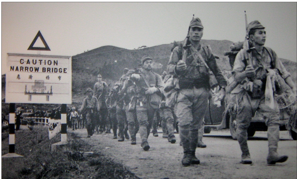
Hong Kong – seized by the Japanese in December, 1941.

When the Japanese entered World War II, in 1941, Cohen was captured in Hong Kong. The Japanese now had a great enemy – but they didn’t know it. By identifying himself as a Canadian businessman, he fooled the Japanese.