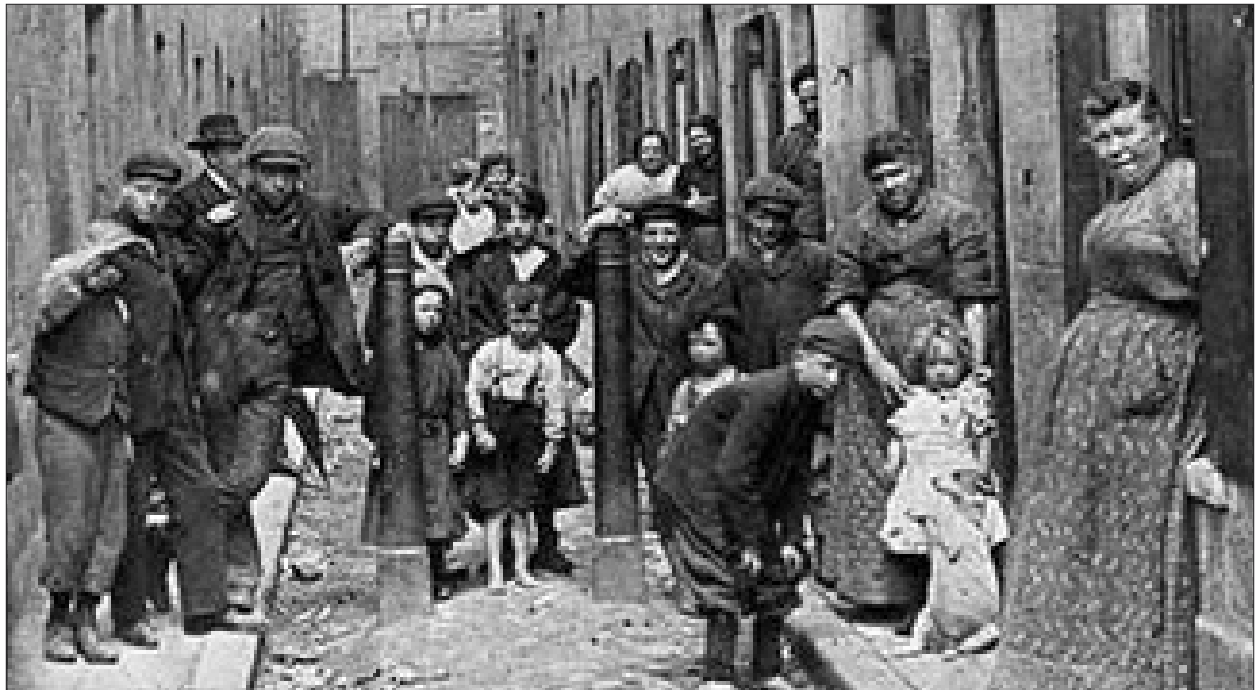
1890's London with widespread poverty at a time when Jack the Ripper spread terror.