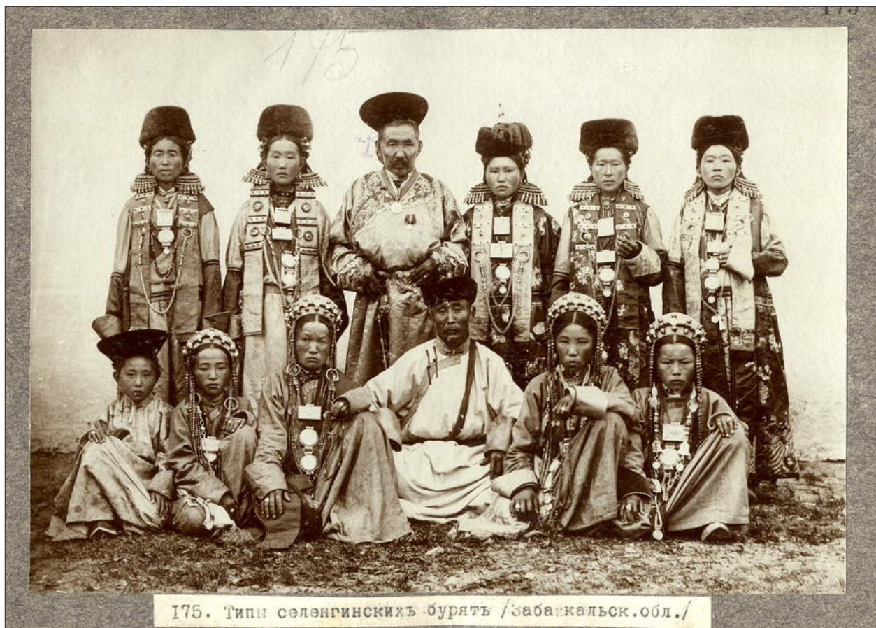
The people of the border area between Siberia and China

Schwartzberg’s flight took him to Siberia, then a lawless region. As he crossed over the border into China, then locked into a Civil War between a democratic party headed by Sun Yat-Sen and a swath of powerful war lords, he stumbled across the near-frozen body of an elderly Chinese man. The man still had a faint pulse, and Schwartzberg dragged him to a nearby Russian Cossack village, and brought him back to consciousness. To the Jewish doctor’s surprise, the Chinese man spoke Russian and after a time, feeling that he was dying, he turned over to Schwartzberg a message from the Soviet Union’s leaders to Dr. Sun (plus gold coins to bribe his way).