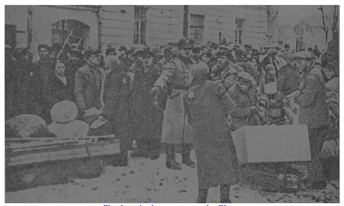
Check-up in the entrance to the Ghetto

The Germans set a ransom fee of 5 kilograms of gold, 20 kilograms of silver, as well as Soviet money, and in order to humiliate them, the Jews were forced to wear a yellow patch on their clothes. On August 1, 1941, they were closed into a ghetto.