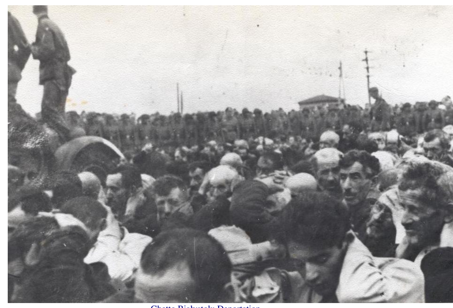
Ghetto Białystok: Deportation

All the groups of fighters from the areas that were abandoned by their habitants were concentrated in the region of Jurowiecka, especially in the streets of Ciepła, Chmielna, Śmolna, Nowogródzka, and Górna. The plan of the resistance headquarters was to destroy the ghetto fences, so that the crowd could be dispersed while the fighters could run into the forests and join their partisan comrades there. The fighters, who no longer concealed their presence among the throng, were joined by dozens of determined people armed with sticks, rods and stones.