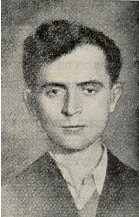
Mordechai Tenenbaum 1940