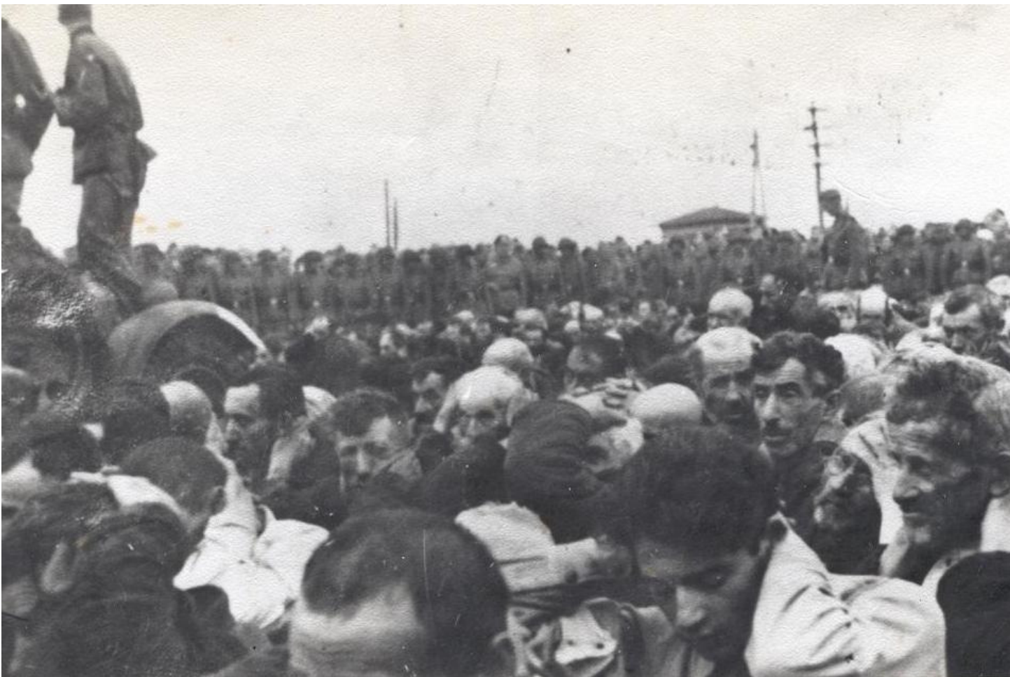
Ghetto Białystok: Deportation

All the groups of fighters from the areas that were abandoned by their habitants were concentrated in the region of Jurowiecka, especially in the streets of Ciepła, Chmielna, Śmolna, Nowogródzka, and Górna. The plan of the resistance headquarters was to destroy the ghetto fences, so that the crowd could be dispersed while the fighters could run into the forests and join their partisan comrades there. The fighters, who no longer concealed their presence among the throng, were joined by dozens of determined people armed with sticks, rods and stones.