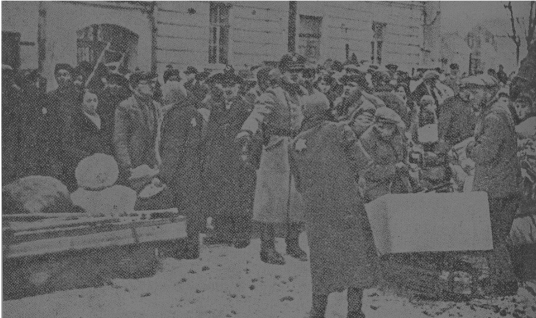
Check-up in the entrance to the Ghetto

The Germans set a ransom fee of 5 kilograms of gold, 20 kilograms of silver, as well as Soviet money, and in order to humiliate them, the Jews were forced to wear a yellow patch on their clothes. On August 1, 1941, they were closed into a ghetto.