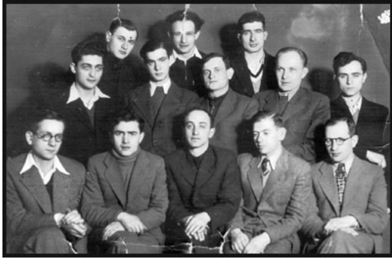
Members of the Białystok Jewish Underground