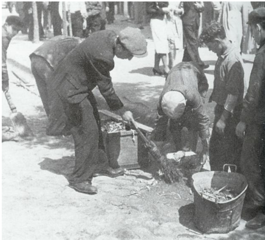
Forced labour in Ghetto Białystok